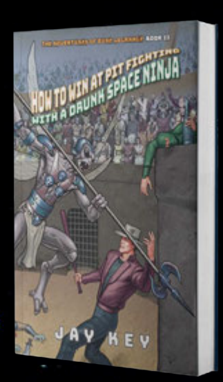
How to Win at Pit Fighting with a Drunk Space Ninja