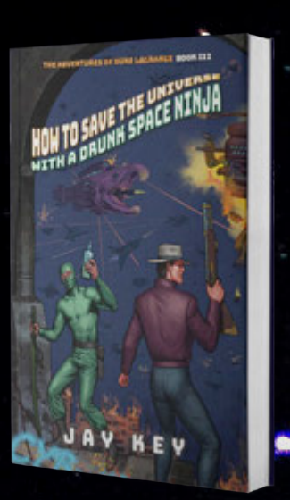
How to Save the Universe with a Drunk Space Ninja